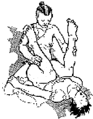
No:1 The Missionary